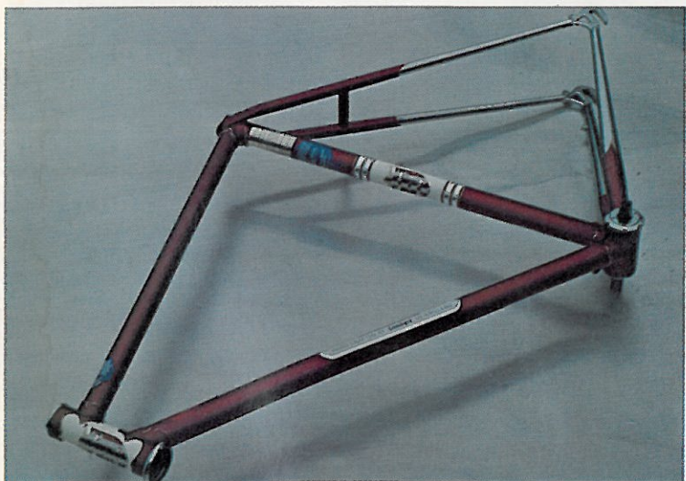
FRAME: Hand built from Lambert 1027 cold drawn seamless alloy steel tubing, with wrap over stays and forged rear drop outs.