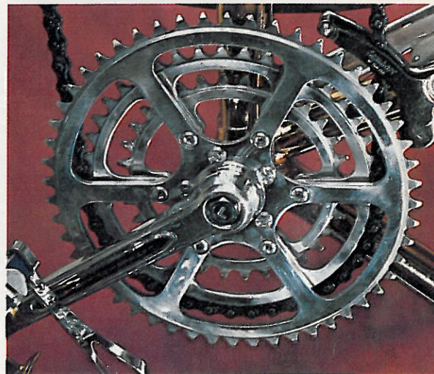
CRANK: Alloy cotterless crank assembly is 15 speed (32, 42, 52), with sealed bearing bottom bracket.