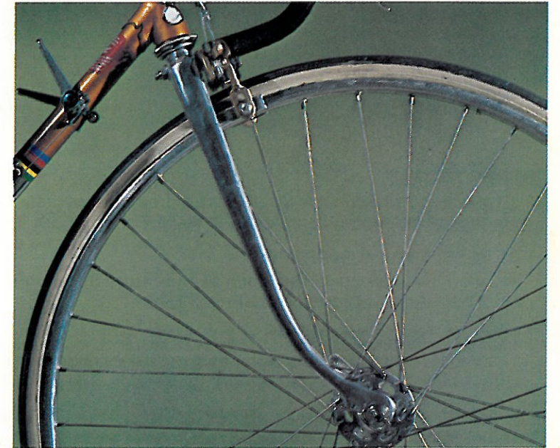
FORKS: Special aerospace alloy one-piece "tuned fork" highly polished metal sleeve over steering column.