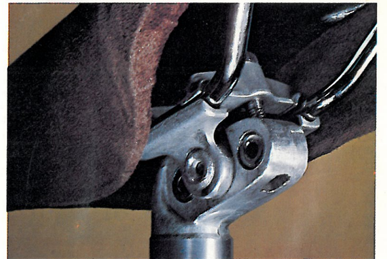
SEAT POST: Ultra-light alloy with adjustable cradle and quick release adjustment.