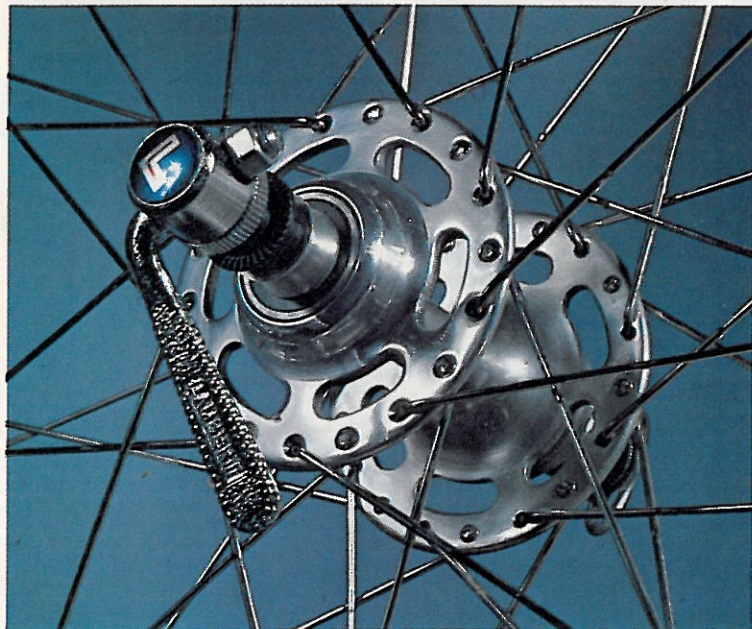
HUBS: Quick release, high flange aerospace hubs fitted with sealed bearing.