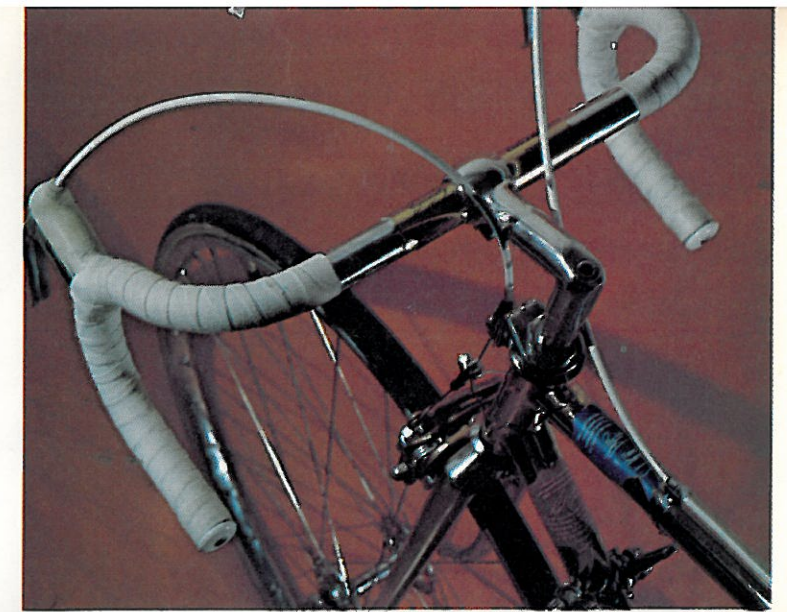
BARS & STEM: Alloy stem with internal allen head bolt and racing style bars.